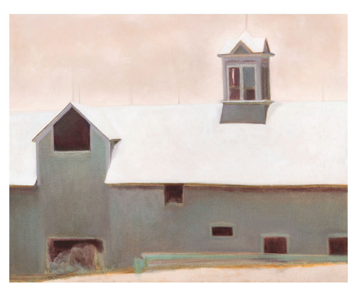
Murmuring Deep oil on canvas 24x36 inches

"Mountain solid: I feel connected to the earth."