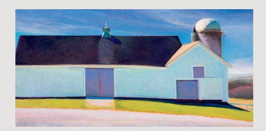
High Light oil on linen 12x24 inches

Choosing when to open myself to others or to embrace solitude has been a challenging skill to cultivate. The world can feel too present and demanding, and it can be difficult to create space to think. As I paint images of doorways, vistas, and sightlines through buildings, I am also painting a way towards insight.