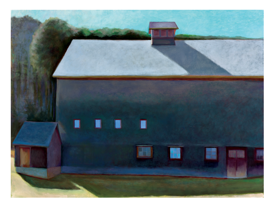
Lovingkindness oil on linen 18x24 inches

I love the sometimes whimsical, and occasionally haunting, balance/imbalance of windows and doorways in simple farm architecture, and the contrasts in scale of farm structures built by hand from local materials.