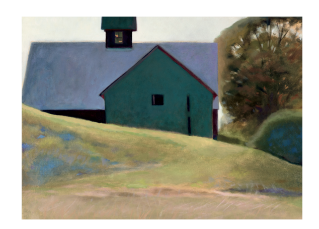
Aleluja oil on linen 18x24 inches

My actions are my only true belongings. I cannot escape the consequences of my actions. My actions are the ground upon which I stand.