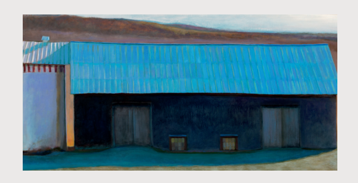
Benediction oil on linen 12x24 inches

There is a zen quality that infuses certain barns as they meld form and function with a spare and serene honesty.