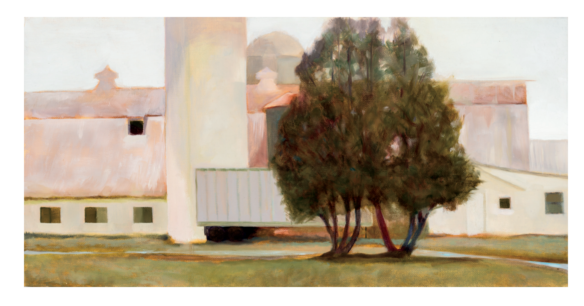
The Urge for Going oil on linen 10x20 inches

"Water reflecting: I can see with insight when my mind is still, like calm lake water."