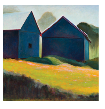
Kathryn Milillo barn paintings