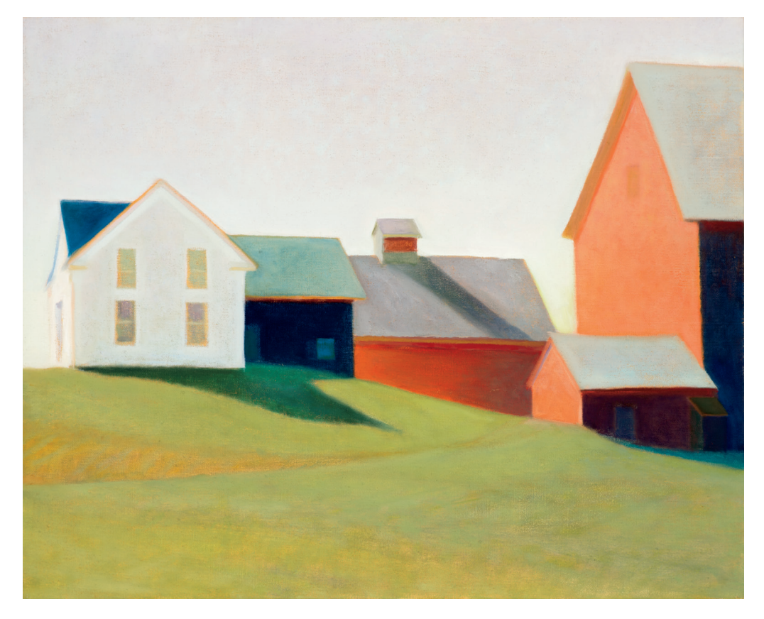
Awakening oil on linen 17x21 inches

The brilliant sparkle of backlit shadows. Quiet colors that resonate and glow. The beautiful decay of a simple old dairy barn. I love the paradox of opposites, like my mother's Irish forebears who set sad lyrics to happy music. Embracing the complexity of life through the lens of aging barns in Vermont and nearby Lake George, I hope to convey the gratitude I feel for the ordinary and the extraordinary that dazzle me, and bring joy to my life.