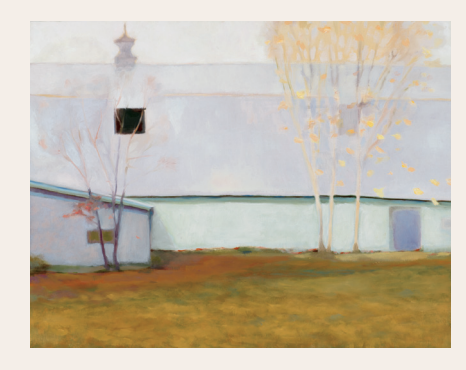
Losing Love oil on linen 14x18 inches

A lonely sentinel on a mountaintop, or a small herd nestled in a valley – barns are powerful structures, filled with memories of nurturing and struggle.