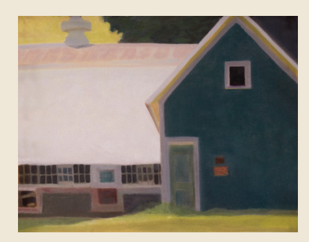
Abandonment II oil on canvas 14x18 inches

Karuna (compassion) involves the capacity to relieve the suffering of another person. Mudita (joy) is experienced when we can feel joy for others even though we ourselves are suffering. Upeksha (equanimity) requires the wisdom to see things as they truly are, without prejudice. Maitre (lovingkindness) offers love that is filled with understanding and acceptance. Together, they contribute to the achievement of a transformative happiness. (I hope I get there.)