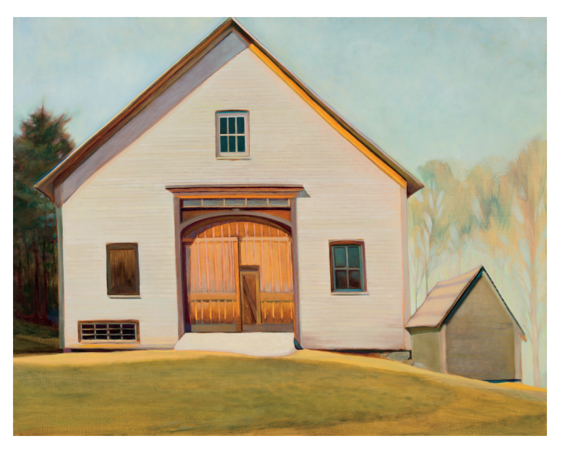
Abide with Me oil on linen 22x28 inches

For me these barns are as spiritually beautiful as any cathedral. They abide, mute and unflinching – no longer needed in a mechanized world of plastic-wrapped hay bales.