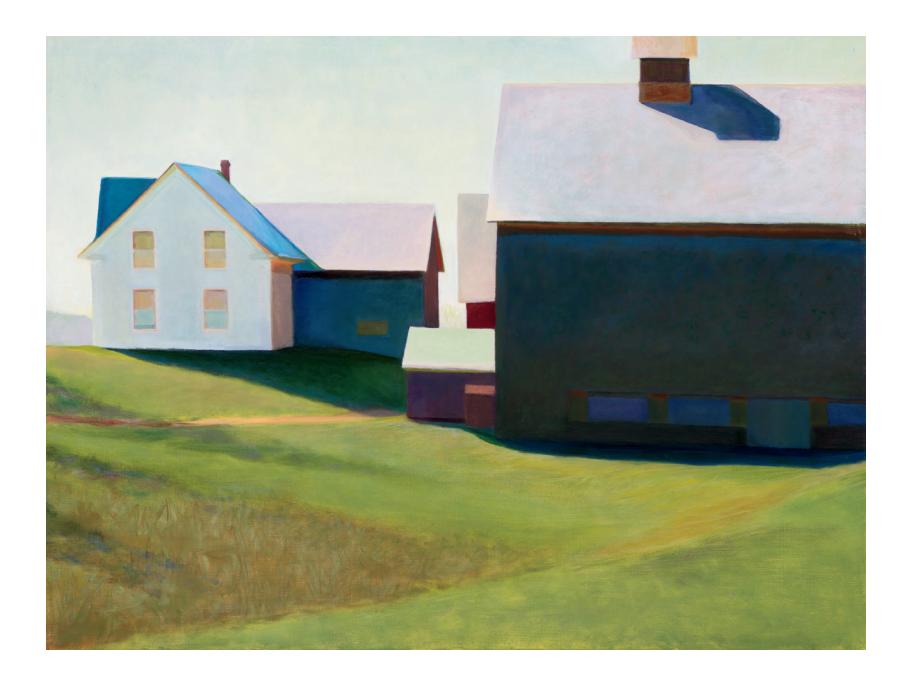
Study for Awakening oil on linen 18x24 inches