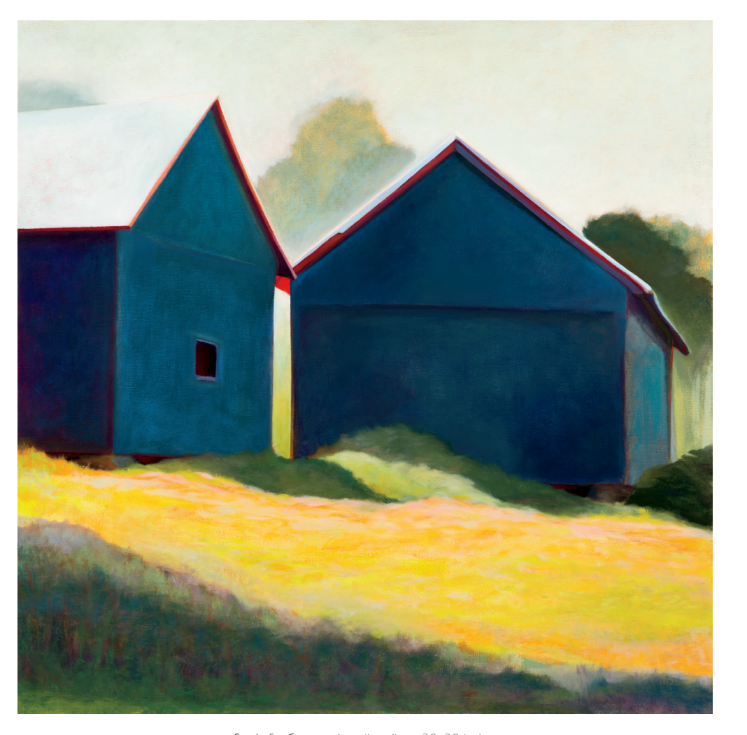
Study for Compassion oil on linen 30x30 inches

Farmscapes of slowly crumbling buildings challenge our current values. These aging matriarchs and patriarchs sheltered and nourished us in their prime, and I want to honor their dignity in the face of diminished relevance. Turning simple barns into icons of strangers, relatives and friends has brought me a sense of contentment and peace.