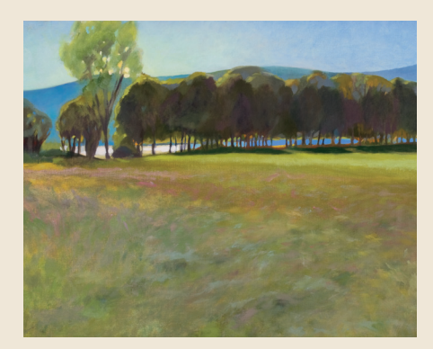
Opening Farewell oil on linen 16x20 inches

The effects of light on water have taken up hours of mesmerizing study. Still water offers an opportunity to look into hidden depths, as well as to see the reality that is reflected onto the water's surface. The tranquility of a single moment, captured over an extended time span, gives me a sense of being both lost to time and immersed in the present.