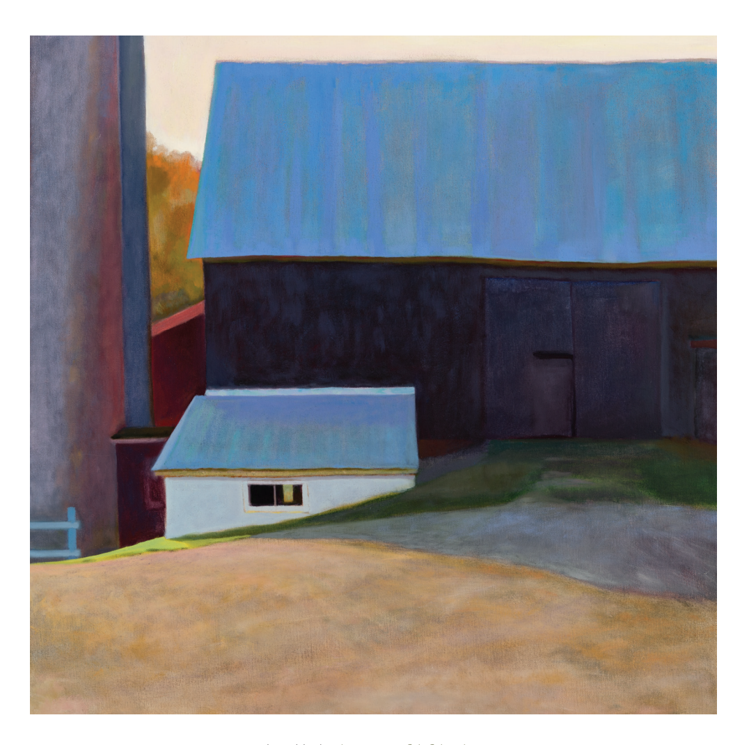
Love Heals oil on canvas 24x24 inches

"Space free: I am free to be my best self when I breathe deeply and allow myself the space to be just as I am."