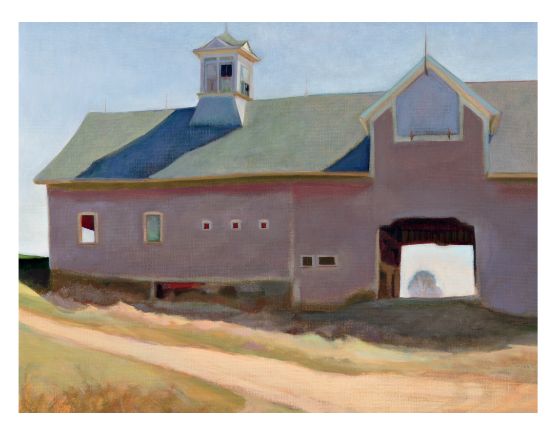
Let It Be oil on linen 18x24 inches

Over the past 20 years, barns have become a personal gateway to interpret love and loss. Squinting at narrow doorways, light-filled cupolas and skylit windows, I've pondered the meaning of structures touching, almost touching, or wide apart. Gradually, I've discovered a non-verbal language that feels truthful to my experience.