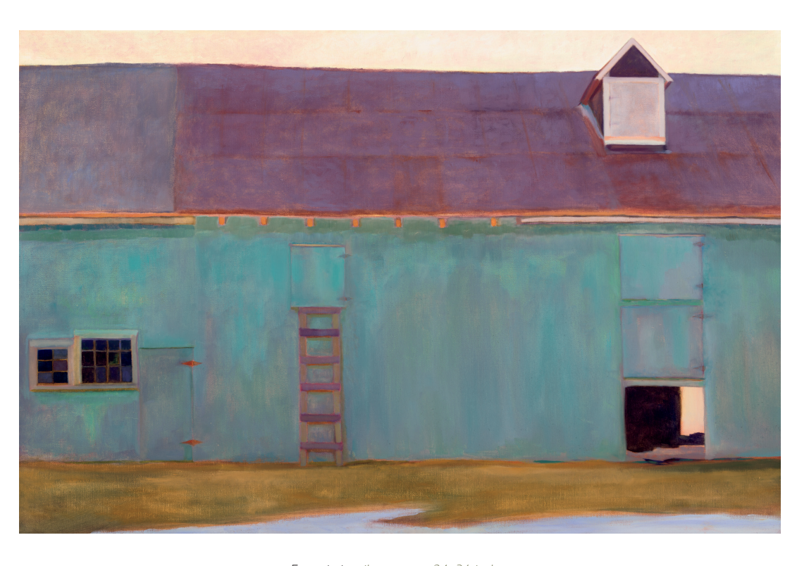
Equanimity oil on canvas 24x36 inches

Karuna (compassion) involves the capacity to relieve the suffering of another person. Mudita (joy) is experienced when we can feel joy for others even though we ourselves are suffering. Upeksha (equanimity) requires the wisdom to see things as they truly are, without prejudice. Maitre (lovingkindness) offers love that is filled with understanding and acceptance. Together, they contribute to the achievement of a transformative happiness. (I hope I get there.)