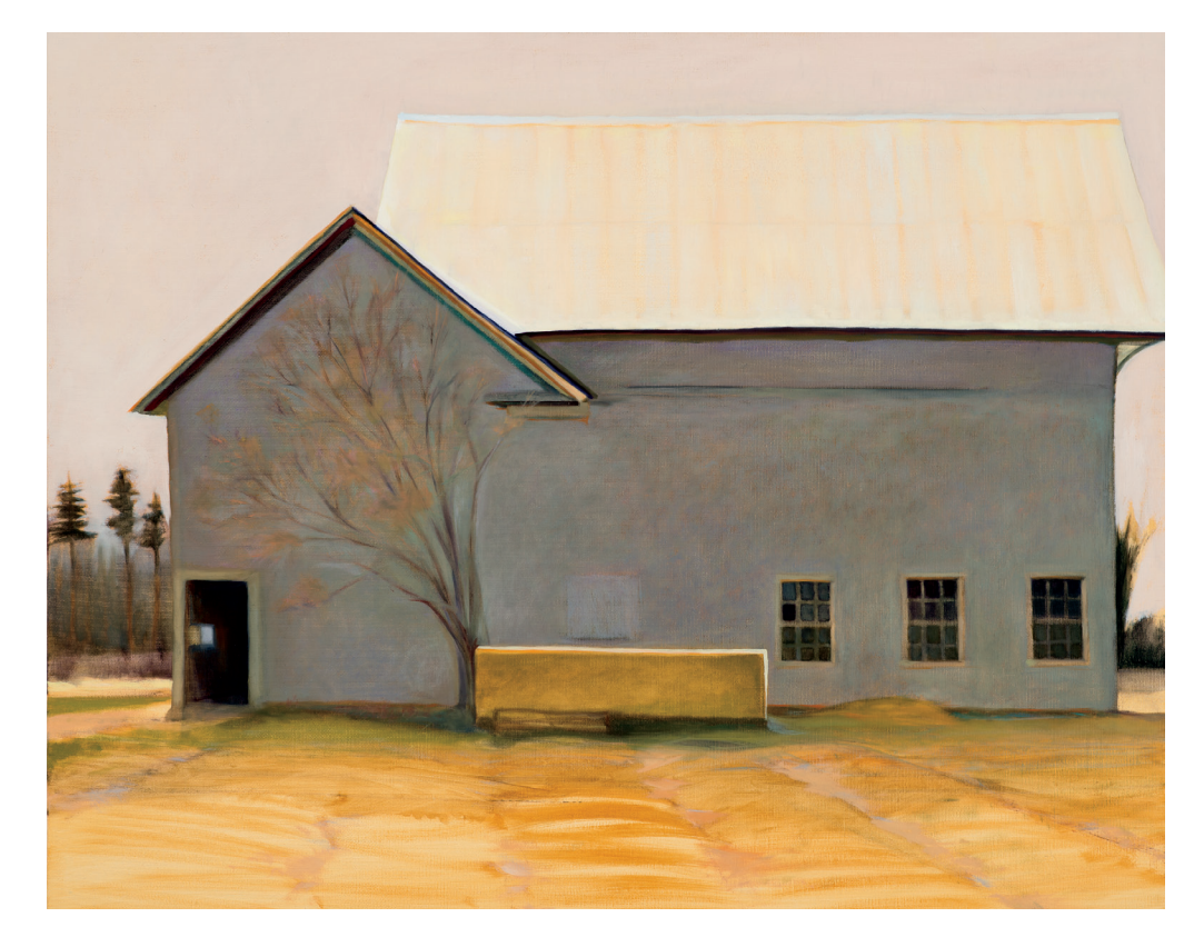
The Urge to Merge oil on linen 20x24 inches