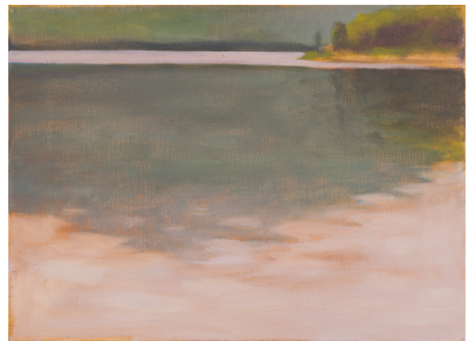
"Contemplation Study III" oil on linen, 9" x 12" $350