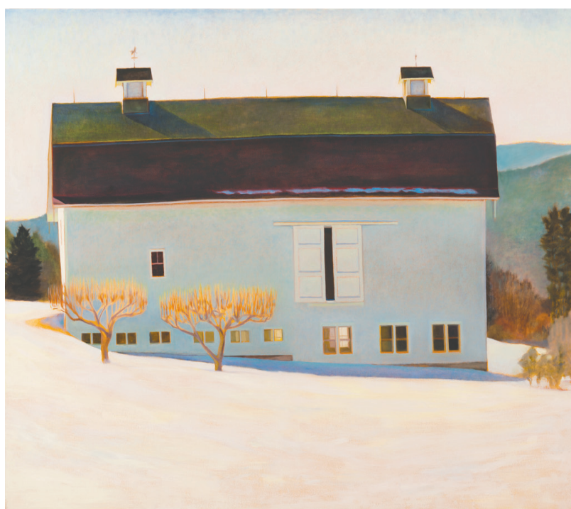
"Saving Grace" oil on canvas, 36" x 48" $4,320