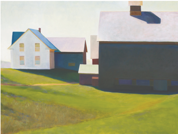
“Study for Awakening” oil on linen, 18” x 24” $1,200