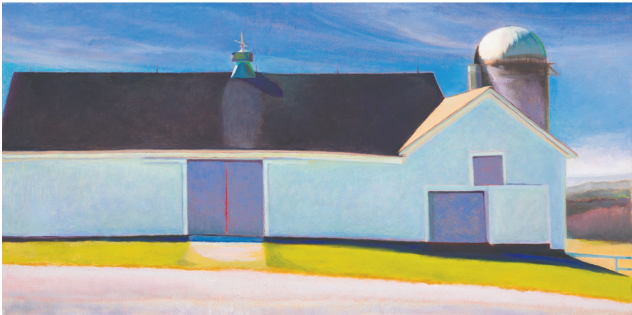
"High Light" oil on linen, 12" x 24" $875