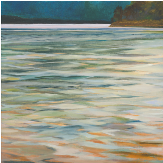
"Contemplation I" oil on linen, 24" x 24" $1,600