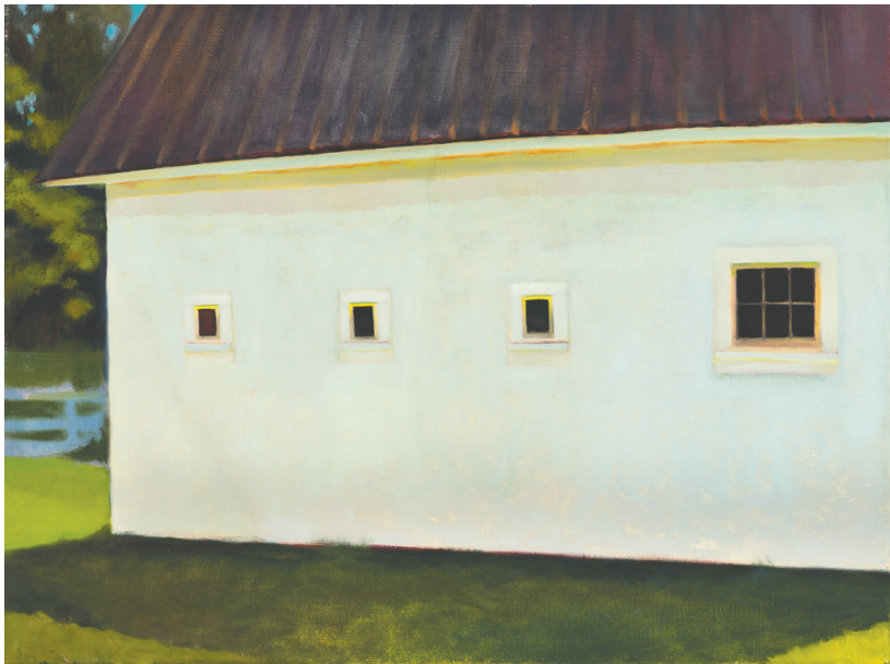
“Upon Further Reflection” oil on linen, 18” x 24” $1,200