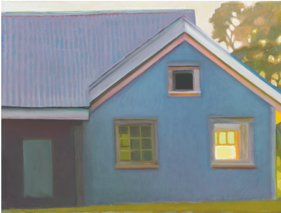
"Heart of Gold" oil on canvas, 9" x 12" $350