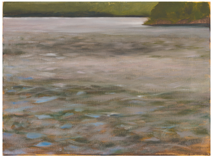
"Contemplation Study I" oil on linen, 9" x 12" $350