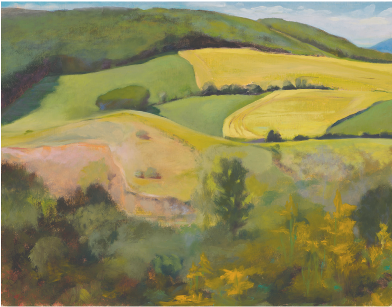
"Fields of Gold" oil on linen, 14" x 18" $830