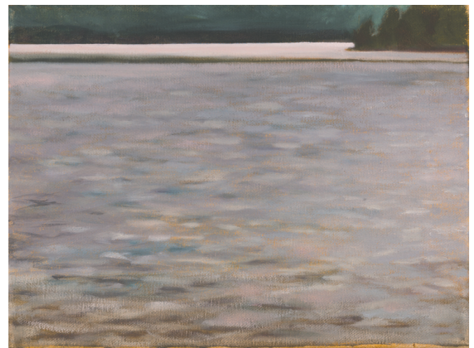
"Contemplation Study II" oil on linen, 9" x 12" $350