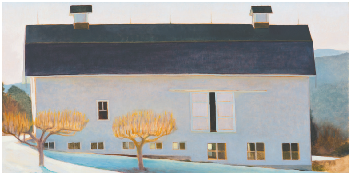
“Grace Abounding” oil on linen, 18” x 36” $1,800 SOLD