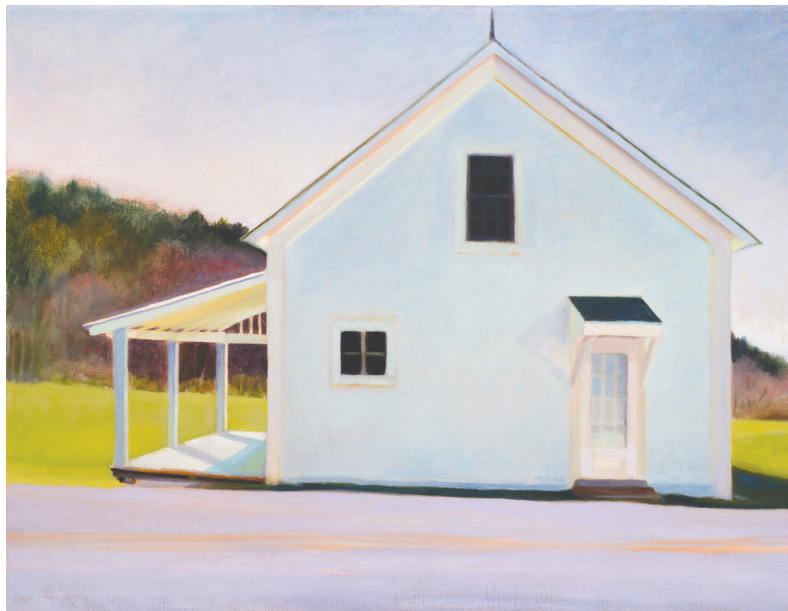
"Simple Gifts" oil on linen, 14" x 18" $830