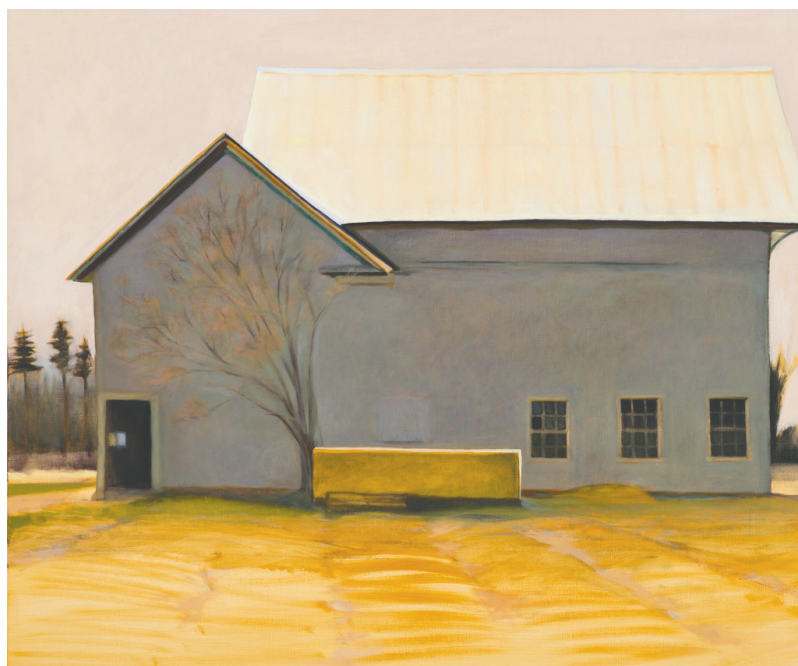
"The Urge to Merge" oil on linen, 20" x 24" $1,340