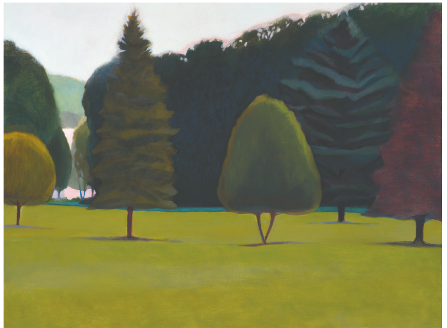
"A Chorus Line" oil on linen, 18" x 24" $1,200