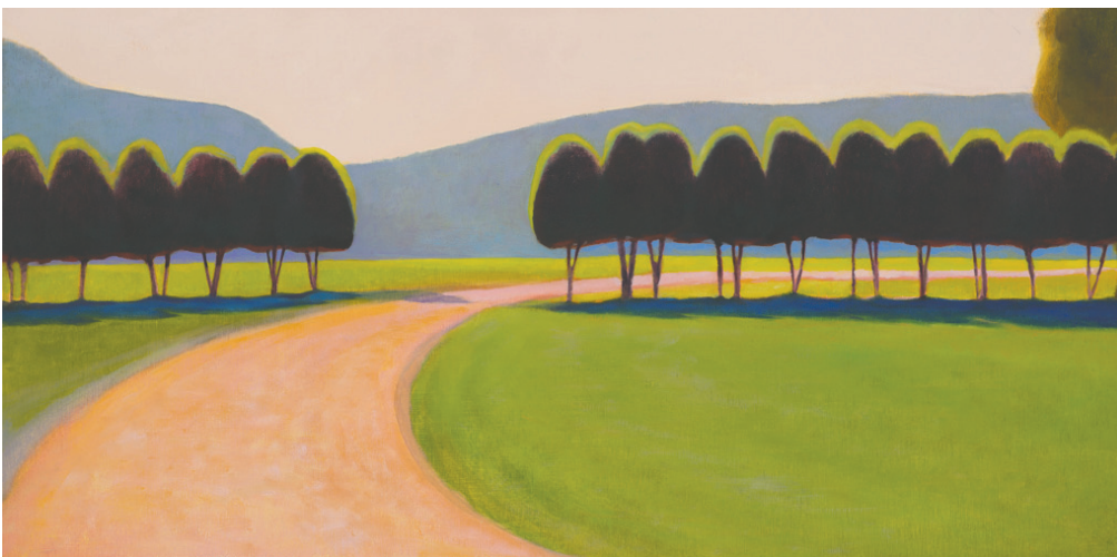
"The Middle Way" oil on wood, 12" x 24" $875 SOLD