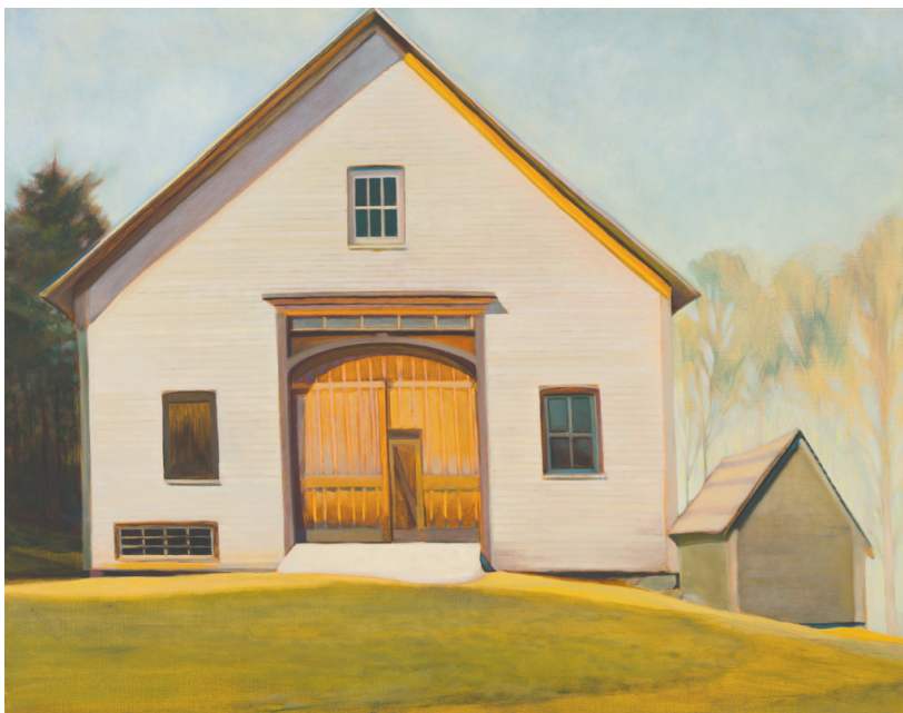
“Abide with Me” oil on linen, 22” x 28” $1,725 SOLD