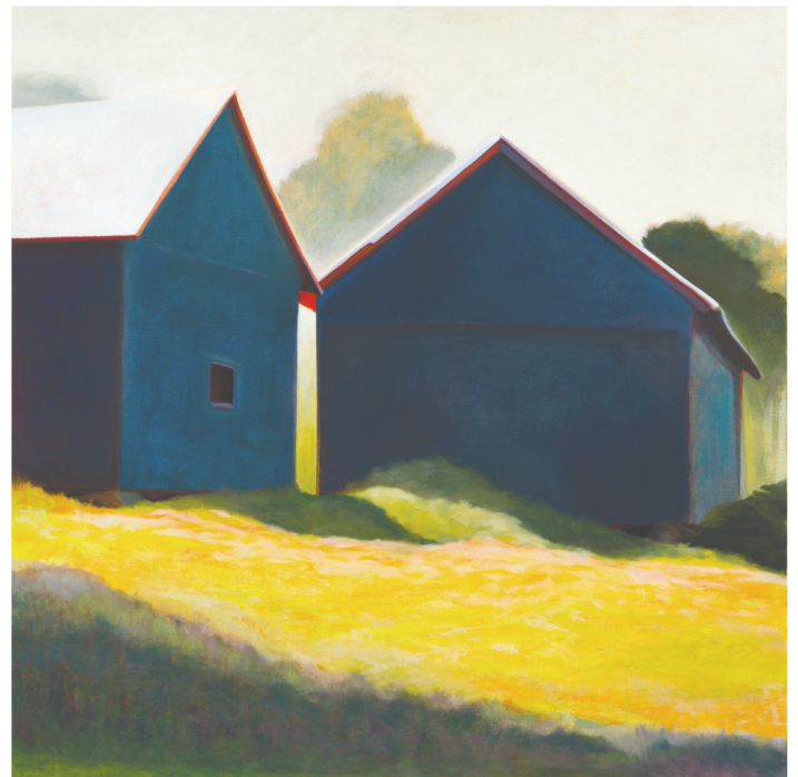
“Study for Compassion II” oil on linen, 30” x 30” $2,250